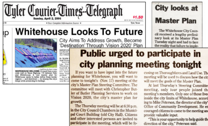
Image 1.2: A total of thirteen newspaper articles were published in the Tri-County Leader and/or Tyler Courier-Times-Telegraph which advertised various public workshops held to seek input on the Vision 2020 project, several were Sunday edition top stories.

Several different advertising techniques were utilized to educate community residents about the opportunity to participate. A total of thirteen public notices and newspaper articles were published in the Tri-County Leader and/or the Tyler Courier-Times--