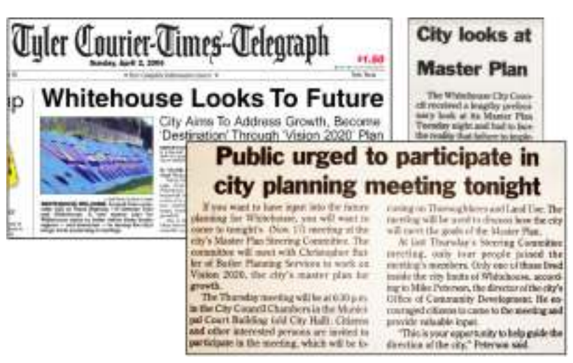
Image 1.2: A total of thirteen newspaper articles were published in the Tri-County Leader and/or Tyler Courier-Times--Telegraph which advertised various public workshops held to seek input on the Vision 2020 project, several were Sunday edition top stories.

Several different techniques advertising were utilized to educate community residents about the opportunity to participate. A total of thirteen public notices and newspaper articles were published in the Tri-County Leader and/or the Tyler