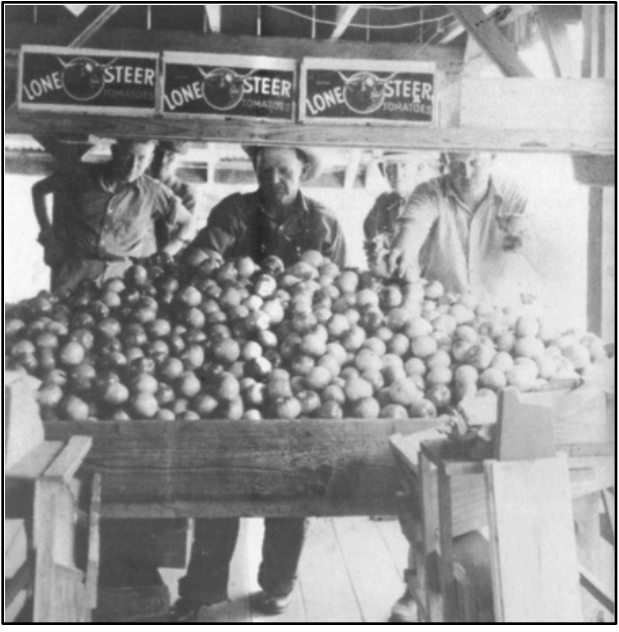
Image 9.17: Many crops were produced within the Whitehouse community prior to the post-World War II era including tomatoes and cotton.

are so strongly associated with Tyler, a strong community association would be difficult to establish. Tomatoes are currently strongly associated with Jacksonville, Texas. As a result, any association between Whitehouse and a particular agricultural product may be difficult to establish for potential tourists throughout the East Texas region. However, the heritage of agriculture, farming culture, or the railroad should not be ignored as possible community symbols.