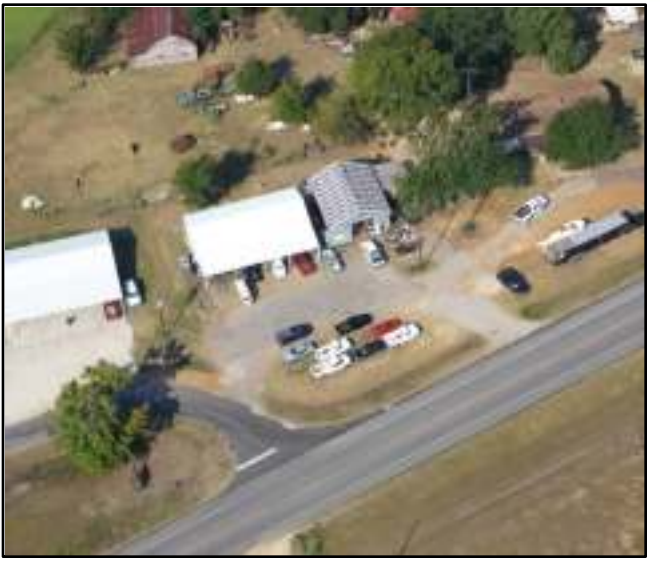
development will have a higher tax | Image 9.6: Unregulated commercial and residential development fronting on State Highway 110 South includes some well-regarded businesses, which are found in buildings frequently identified as eyesores by citizen participants.

the City can justify annexing land if provisions for adequate water supply cannot be secured. Whitehouse has historically used revenue from the sale of water and sewer service in order to partly defray the high service demands (and relatively low tax revenues) of single-family homes. Annexing land without the ability to sell water will be costly unless the anticipated