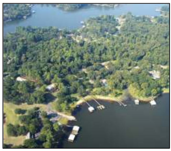
Image 9.4: High-end homes located on lake-front property within the ETJ of

Whether the gateway welcomes travelers from southeastern Smith County or