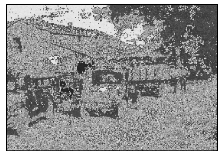
Image 9.16: The Whitehouse community was economically self-sufficient for much of its history with an agricultural based economy. Tomato sheds such as the one pictured here were established as the first processing point for local crops during the early 20th-century.

For most of its early history, residents of Whitehouse self-sufficient were economically. The community arew and produced several agricultural products with tomatoes being the most significant. Cotton and roses were also grown at various times in the community's history. As