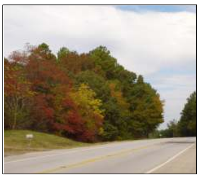
Image 9.5: Rolling hills and attractive stands of trees contribute to the aesthetic appeal of the southern gateway.

Unlike the northern portion of the City, much of the City's southern side remains undeveloped. Although the terrain does include some rolling hills and low points, the overall effect is aesthetically pleasing in its current state (Image 9.5). In most cases, recent building projects have been impacted by Zoning and Subdivision Regulations resulting in some continuity of urban design. Jurisdictional limitations on