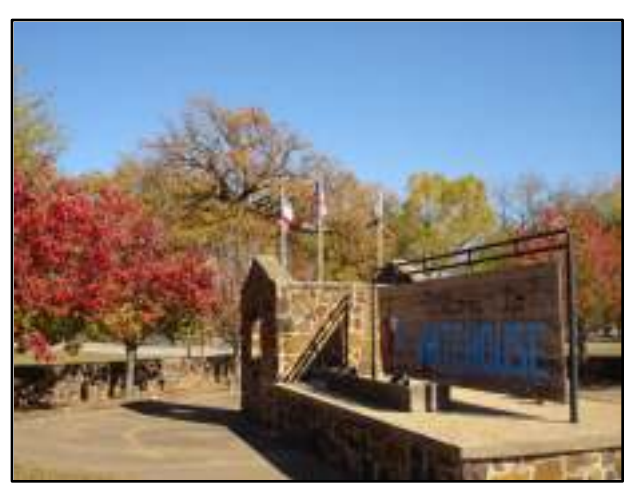
Image 9.12: Whitehouse monument sign constructed from salvaged WPA rock from anold school building formally on the Brown Elementary campus

convention center if the School District redevelops the Brown Elementary site as a part of the envisioned Town Center (Image 9.11). While modern additions, such as the planter boxes in front of the old WPA wall would detract from the