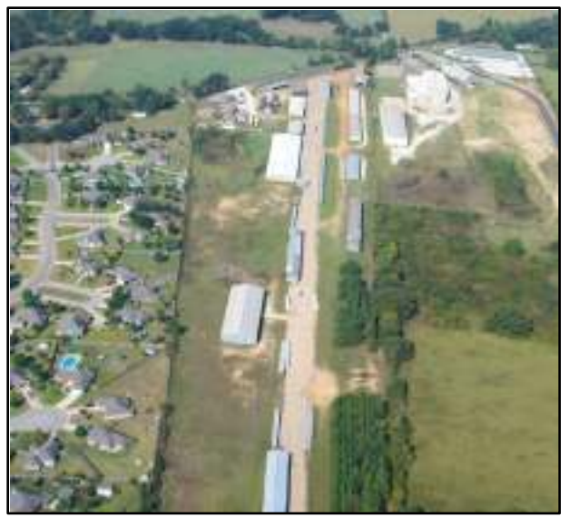
commuter traffic into the City through Image 9.3: Industrial development near single-family homes and in a high profile location near the eastern gateway

TxDOT traffic counts reveal that, as of 2004, just under 4,000 vehicles traveled on FM 346 southeast of the City Limits on a daily basis. Total commuter traffic into the City through