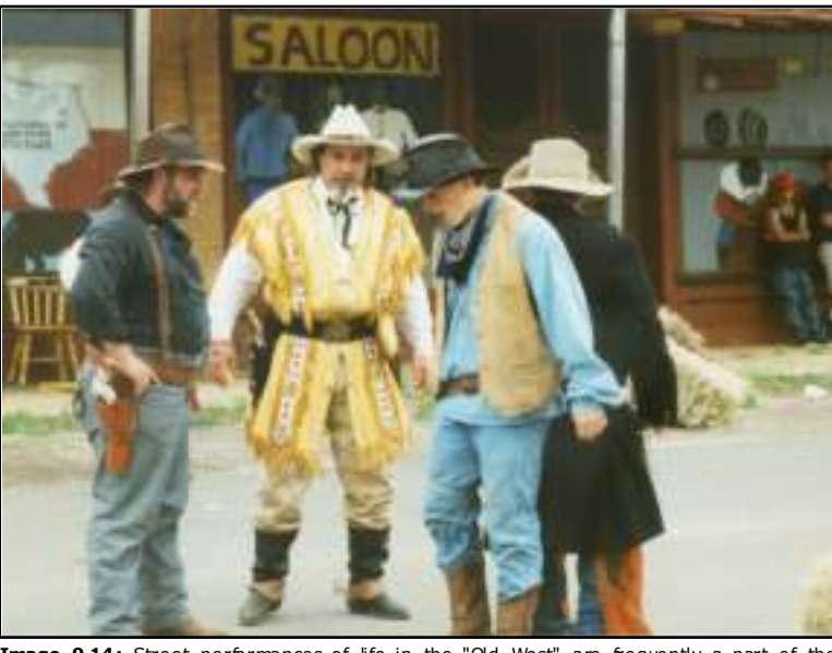
only the City of Tyler, but Image 9.14: Street performances of life in the "Old West" are frequently a part of the Whitehouse YesterYear ælebration (photograph taken during the 1997 festival).

been adorned with images of the wolf or its paw print