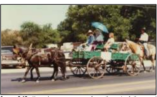
Image 9.13: Horse-drawn wagons are frequently part of the annual Whitehouse YesterYear celebration (photograph of the 1984 parade).

Although the YesterYear Festival does not represent a physical symbol, recognizable it is а celebration of the community's The annual celebration heritage. provides for a branding opportunity to involve citizens from surrounding communities in the City's history.