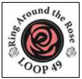
Image 9.9: This possible logo for Loop 49 uses the identifiable "Tyler Rose," a strong local example of marketable symbology.

"Symbology" is a cartography term for drawings used to represent an individual geographic feature among many others on a map. In much the same way every community must associate itself with symbols which uniquely identify it among other municipalities in a region.