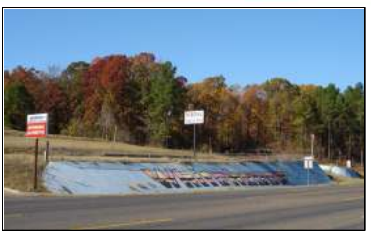
Image 9.1: The painted "Whitehouse" sign is located outside of both the Whitehouse City Limits and ETJ. Un-regulated signage and buildings have created what many participants referred to as "eye sores" within other areas of the Northern Gateway, a trend which will continue without annexation by the City of Tyler.

Drainage concerns on both the east and west side of State Highway 110 will also limit urban development south of the northern City Limits. While bucolic natural settings can considered an asset, City's inability to allow for continuous high-quality urban development from the